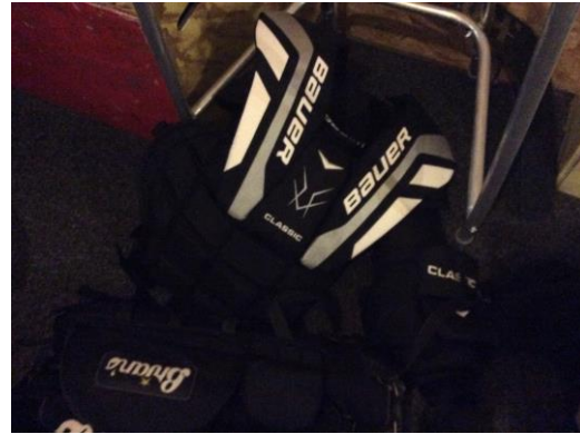
The original photographs