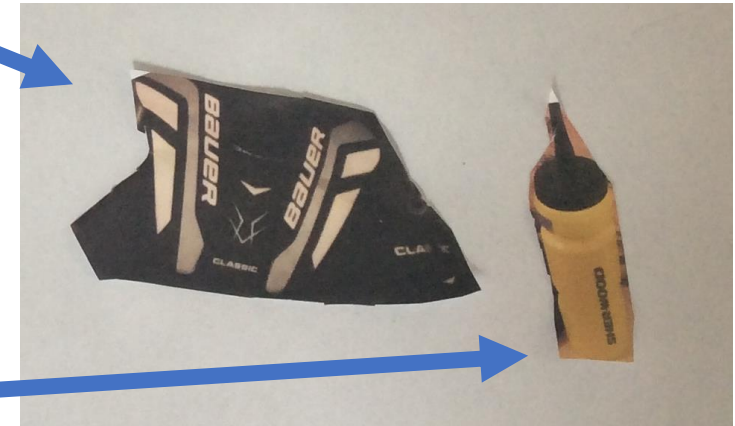
Reflects what is most salient in the original photograph